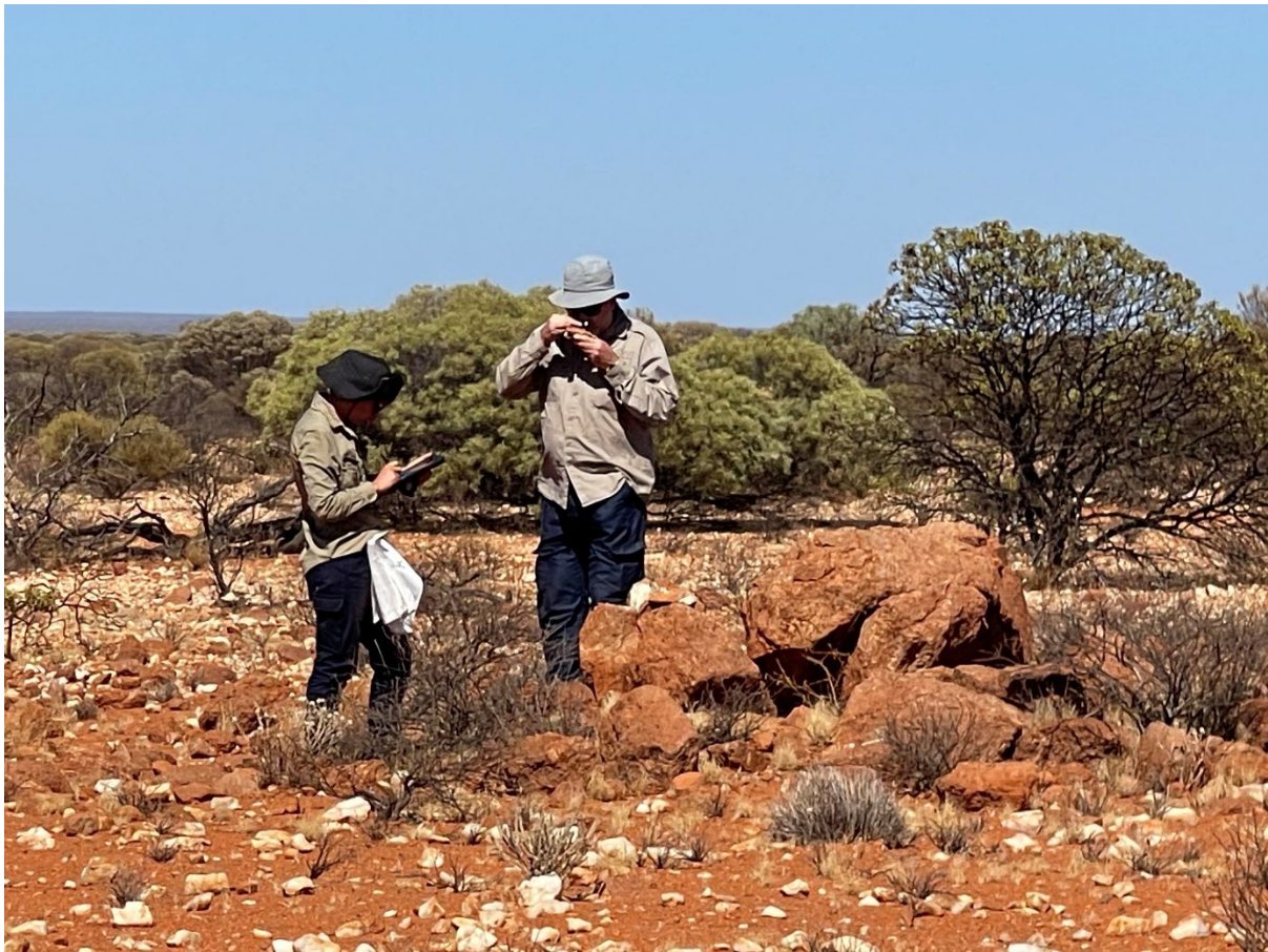
Figure 1: OAR's Exploration Manager and field Geologist, investigating potential LCT pegmatites at Denchi

Alternative arrangements are currently being explored which will also significantly reduce the travel time from base camp to the exploration area, by up to 1.5hrs each way, but still offer the safety and health benefits of a larger mining camp.