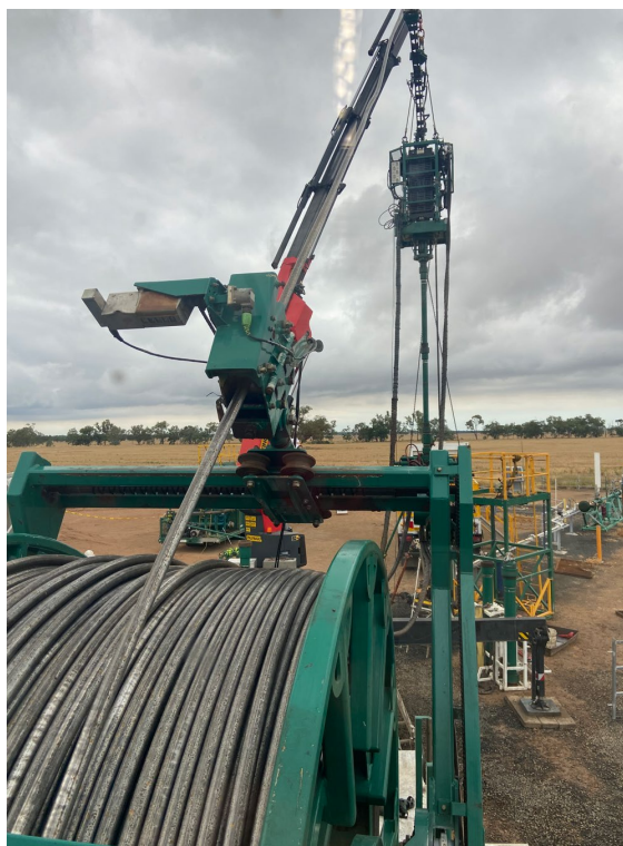
Myall Creek #5A coil tubing intervention Jan 2023