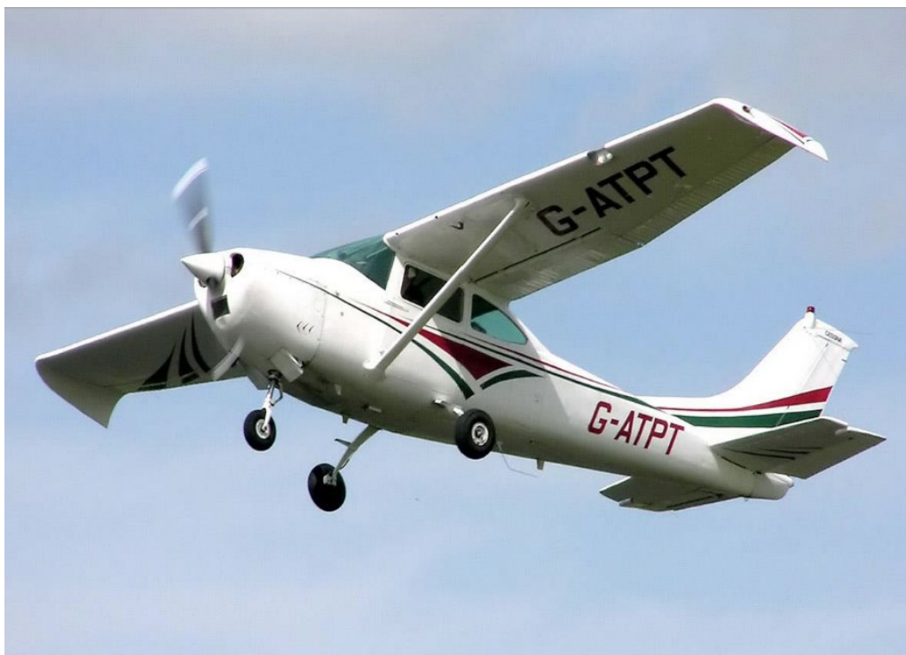
(Acquisition of airborne AEM-PTP - Image accessed Apr '23 https://www.totaldepth.com.au )

"Seisnetcs" AI processing is being undertaken on the Cordillo 3D seismic data volume which is located across multiple Armour Energy PRLs. The intent is to assess multiple surfaces and associated attributes to assist in identifying subtle stacked and stratigraphic oil traps in the Triassic and Jurassic intervals.