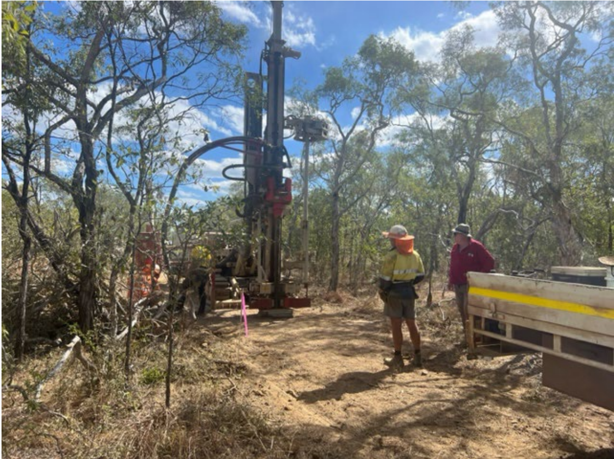
Image 1: Air Core Drill rig in Action, Directors overseeing the commencement of the program