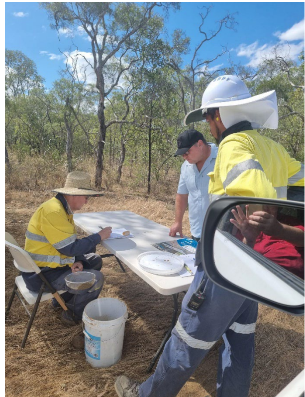
Figure 3 Ark Geologists logging and accessing samples from the air core rig.