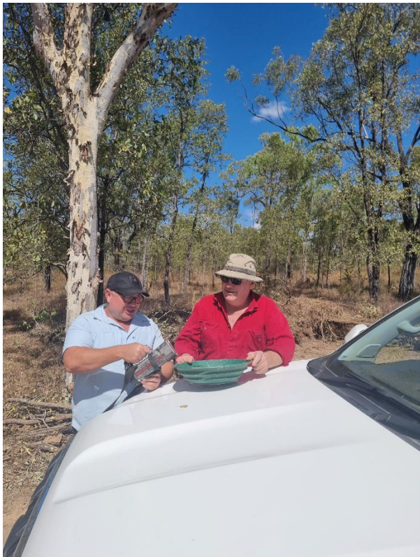
Figure 2 Ark Directors accessing drill samples with the Scintillometer