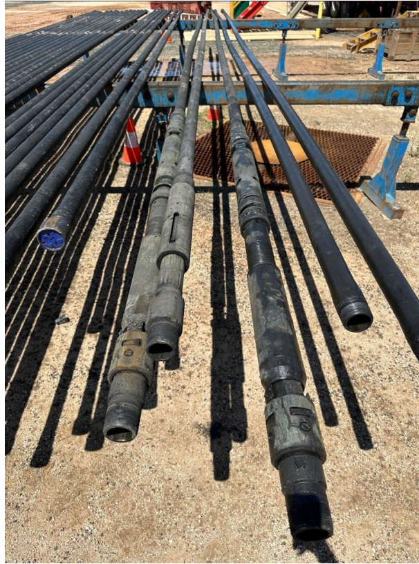
Myall Creek #5A Workover (upper completion)– October 2022