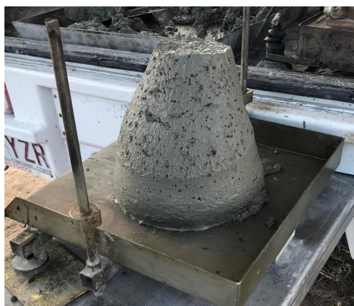
Figure 2 – Great White HRM™ concrete sample, showing enhanced form retention