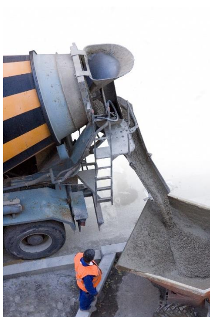
Figure 1 – Great White HRM™ concrete application testing