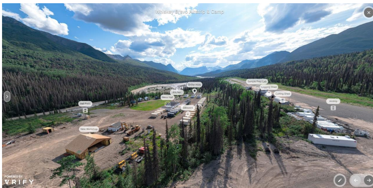
Figure 2. Image of the 360 degree photo site tour for the Estelle Gold Project on the Company's website

For further information regarding Nova Minerals Limited please visit the Company's website www.novaminerals.com.au