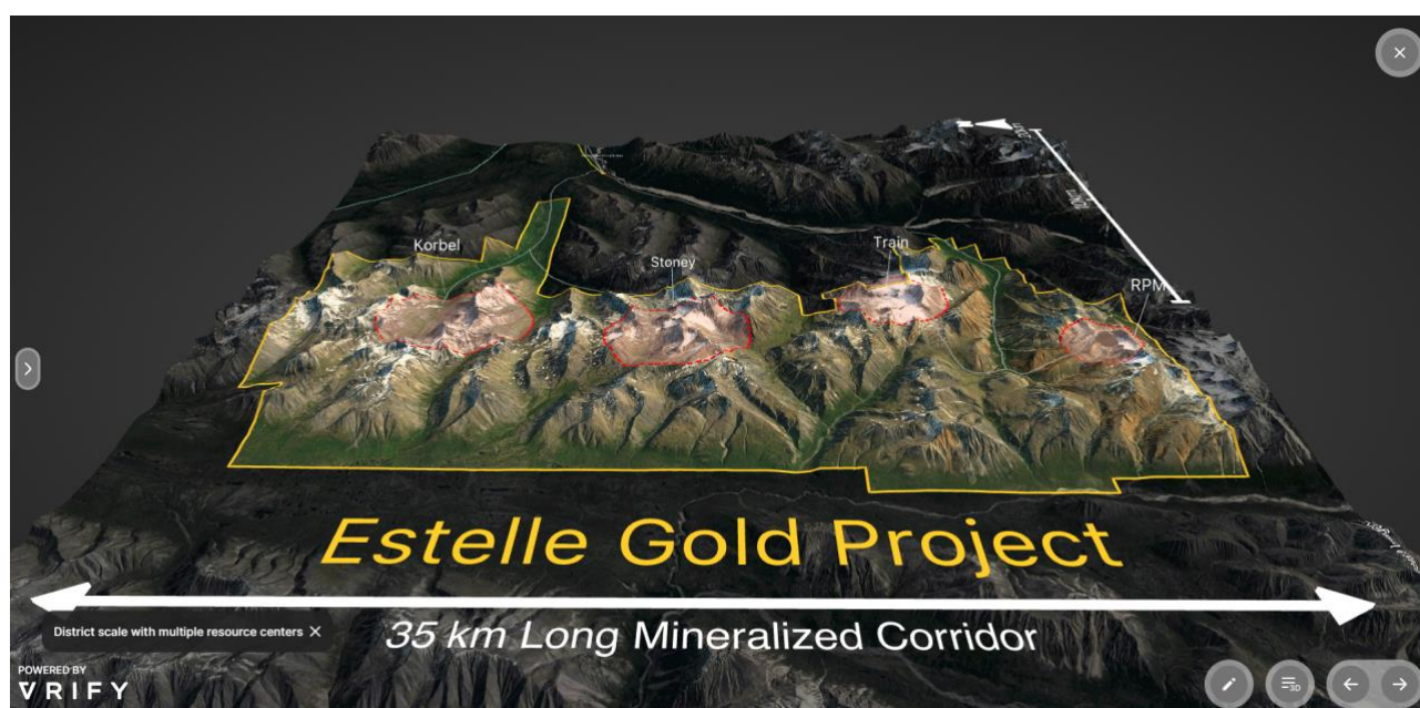
Figure 1. Image of the 3D interactive model for the Estelle Gold Project on the Company's website

Both the 3D interactive model and 360 degree photo site tour can be accessed through the home page, and smaller decks on other pages, on the Company's website www.novaminerals.com.au/