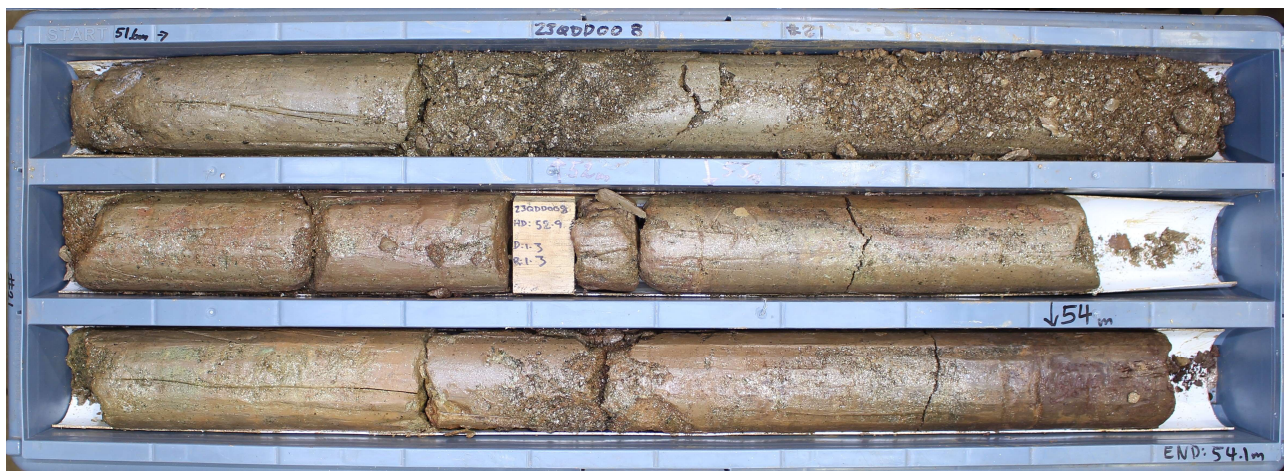
Figure 1: Example of mica rich PQ diamond core – DD008 51.6m to 54.1m, 3 to 4% nickel intervals

As a preliminary assessment, mica concentrates from composite samples 1 and 2 were prepared by hand (see Figure 2) and assayed as reported in Table 3.