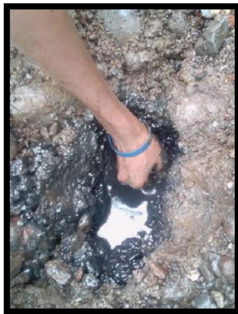
Figure 2. Oil seep observed on West Fergusson Island early 2022