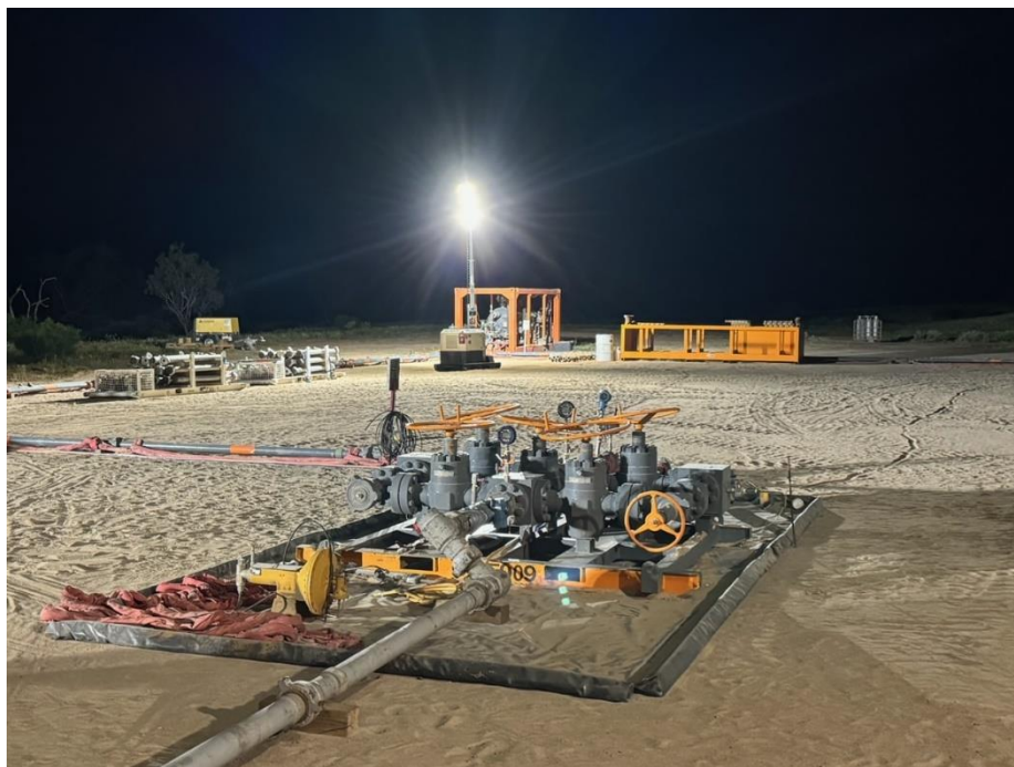
Figure 2: EPT sampling and data gathering activities at Kiwi-1