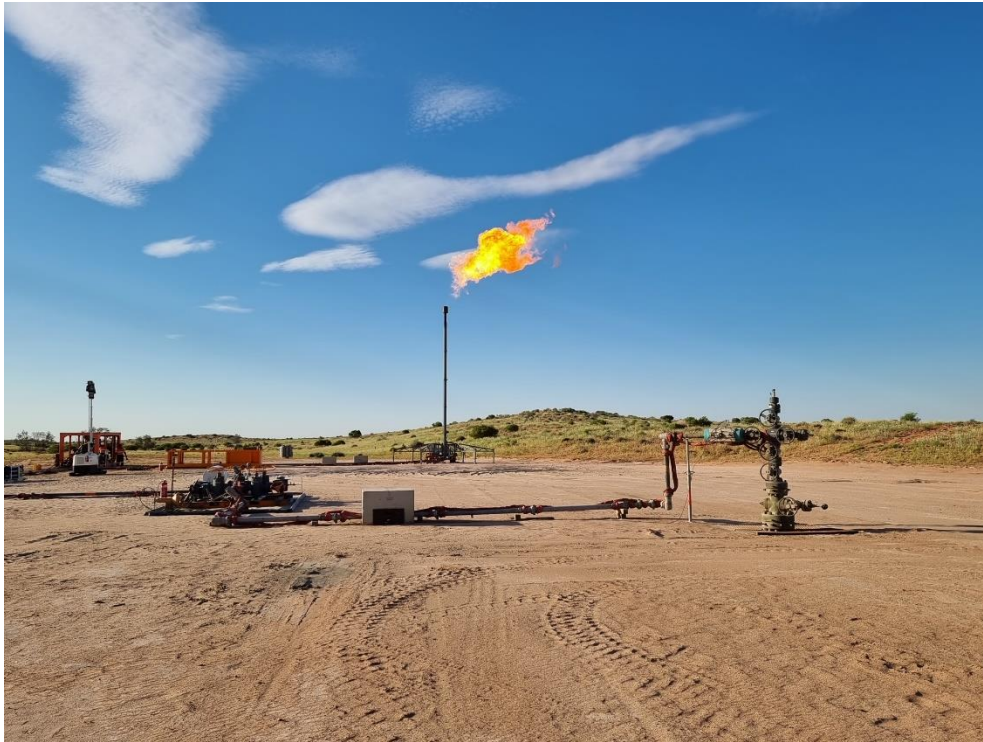
Figure 1: Gas flare from EPT flowing survey at the Kiwi-1 wellsite