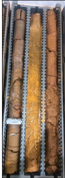
Figure 4: Saponite zones is visible within kamafugite