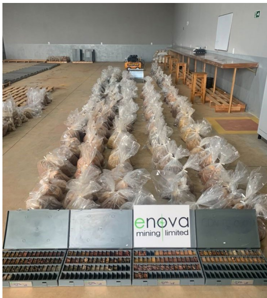
Figure 6: RC Drill sample batches prior to dispatch to laboratory

Over 500 drill samples dispatched to SGS Geosol laboratory (Belo Horizonte) await assay analysis, (see Figure 6). This is additional to samples already submitted to the laboratory over the last few weeks. Enova's exploration team is closely managing the submission process and controlling field activities. Enova will announce assay results as they become available.