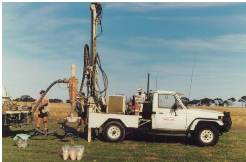
Fig 2: Previous drilling at Tambellup kaolin deposit (now within Halcyon ELA).