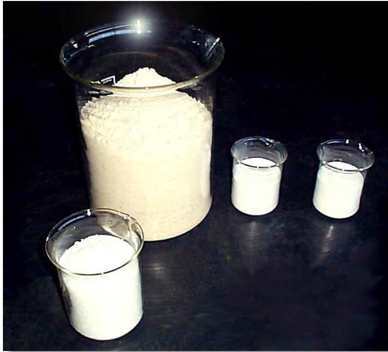
Fig 1: High Purity Alumina produced using the Griffin Process