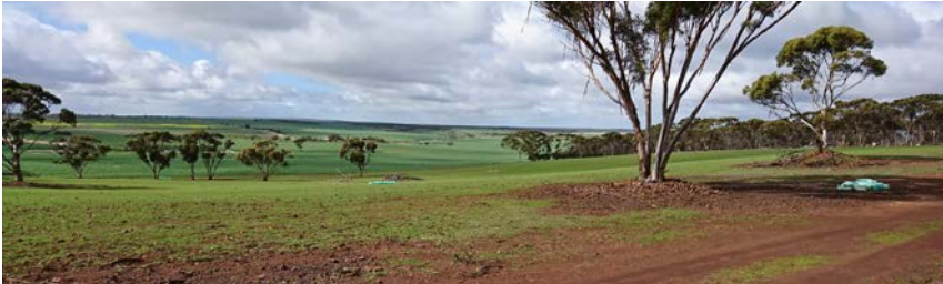
Figure 1 – Bagged drill samples from recent aircore at Quicksilver