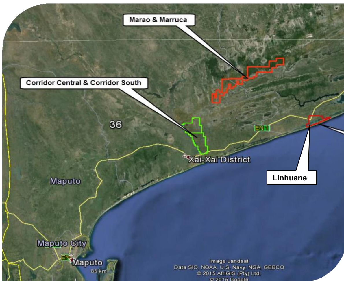
Figure 1: Project locations.