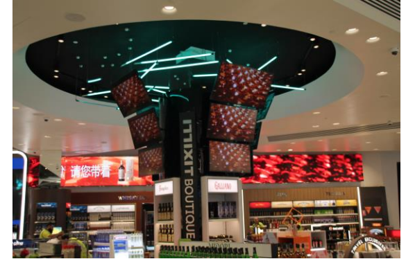
Melbourne Airport T2 Melbourne $1.4 Million