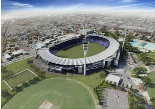
Simonds Stadium Geelong $2 Million