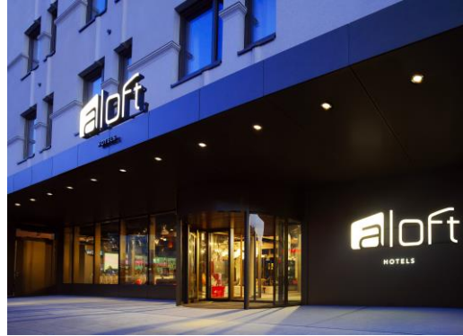
Aloft Hotel Perth $1.7 Million