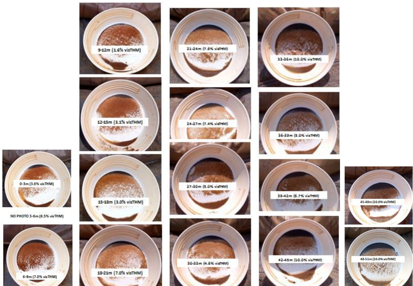
Figure 3: Field pan concentrate photos for aircore hole 19CCAC143 showing the high grades intersected. Each sample shown is panned from the same volume of sand grab sampled from the relevant 3m sample interval.