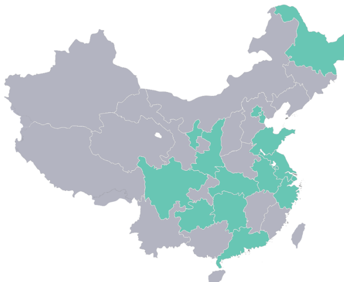
The 15 provinces and districts in China highlighted are covered by current strategic partnerships

The expansion of Fluence into China, both through sales and manufacturing facilities, strongly positions the Company to participate in the planned improvement in China's rural wastewater treatment quality. The Chinese Government's current five-year plan is targeting, and provides finance for, an increase in wastewater treatment for remote rural villages and at the same time to achieve Class 1A effluent discharge. With approximately 10% of rural wastewater currently treated and the five-year plan's target to reach 70% treatment of wastewater in China, Fluence's Smart Packaged Aspiral™ system featuring MABR technology is the lowest cost treatment alternative available in the decentralised market, and simultaneously guarantees to consistently reach Class 1A effluent discharge standards.