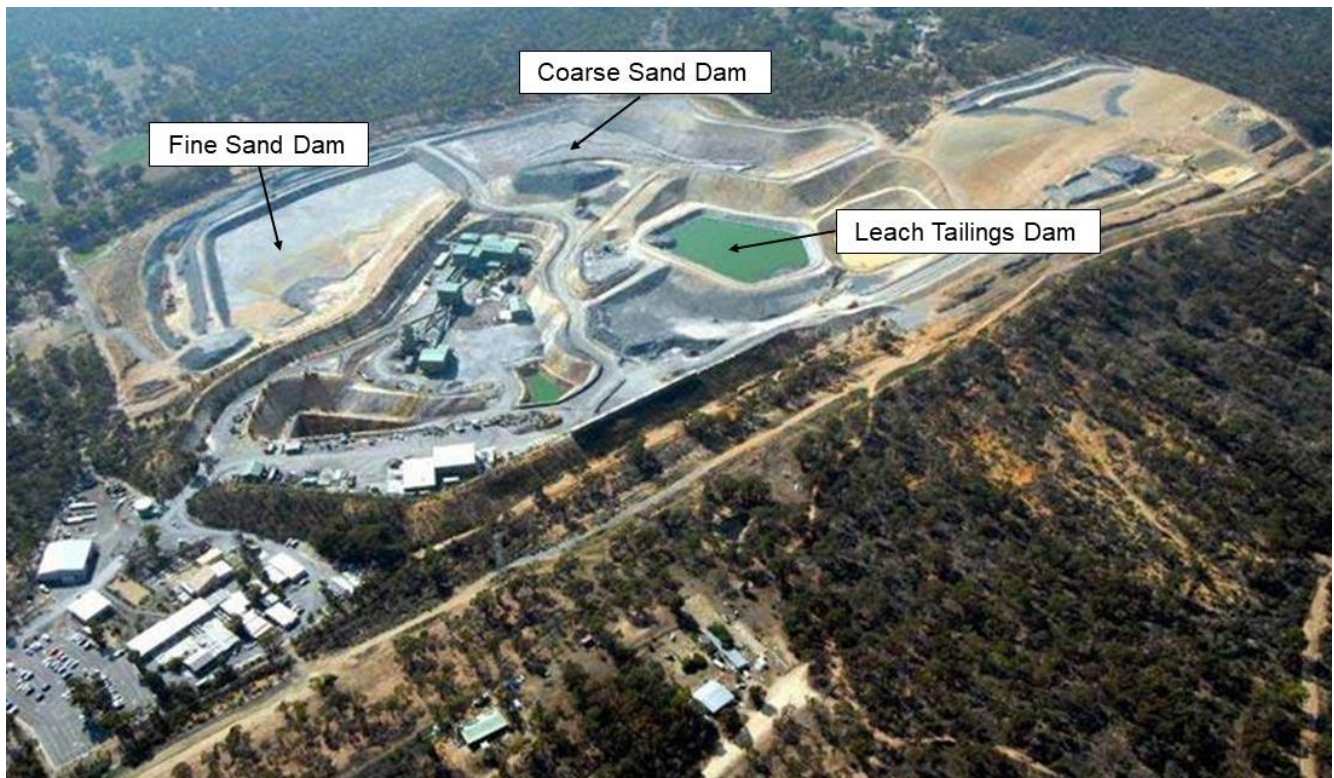
Figure 2: Kangaroo Flat Site

Implementing these principals resulted in the construction of separate dams for Coarse Sand, Fine Sand and Leached Tailings (Figure 2).