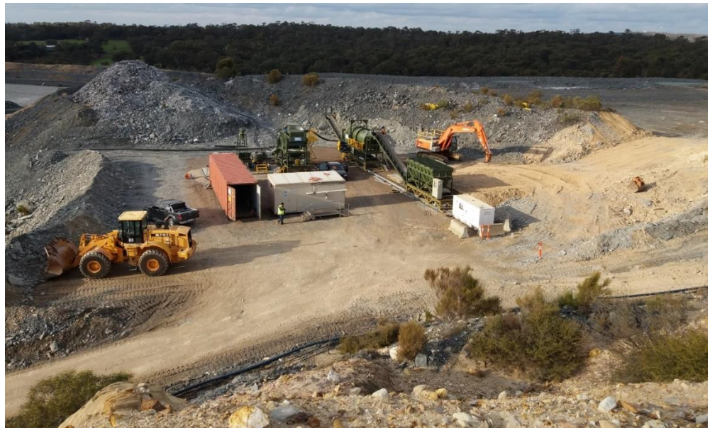
Figure 1: Kangaroo Flat Coarse Sand Dam Wash Plant

The wash plant containing 2x35tph Great Engineering (GE) concentrators to recover the contained gold and sulphides have been installed and commissioned and is projected to be in operation early in 2019 (see Figure 1). Additional gravity separation equipment is being added to the circuit to increase the efficiency of the operation. The sand dam is estimated to hold 320,000 tonnes indicated and 110,000 tonnes inferred for a total of 430,000 tonnes of material containing 5,100 ounces of gold at a grade of 0.37 g/t as reported in the revised March 2017 Quarterly Report released in April 2017. The project is expected to take two to three years to complete. Profit will be shared 50/50 between the parties.