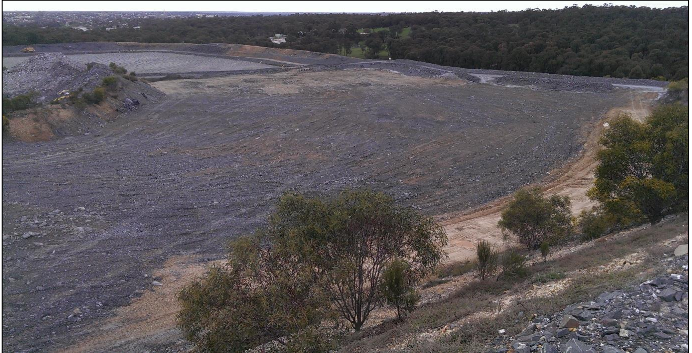
Figure 4: Coarse Sand Dam

The original concept was for the sale of the 430,000 tonnes of sand in the Coarse Sand Dam (Figure 4) for reuse in markets such as the packing sand and concrete market, this did not occur. Reprocessing the sand will improve the quality and increases potential for reuse.