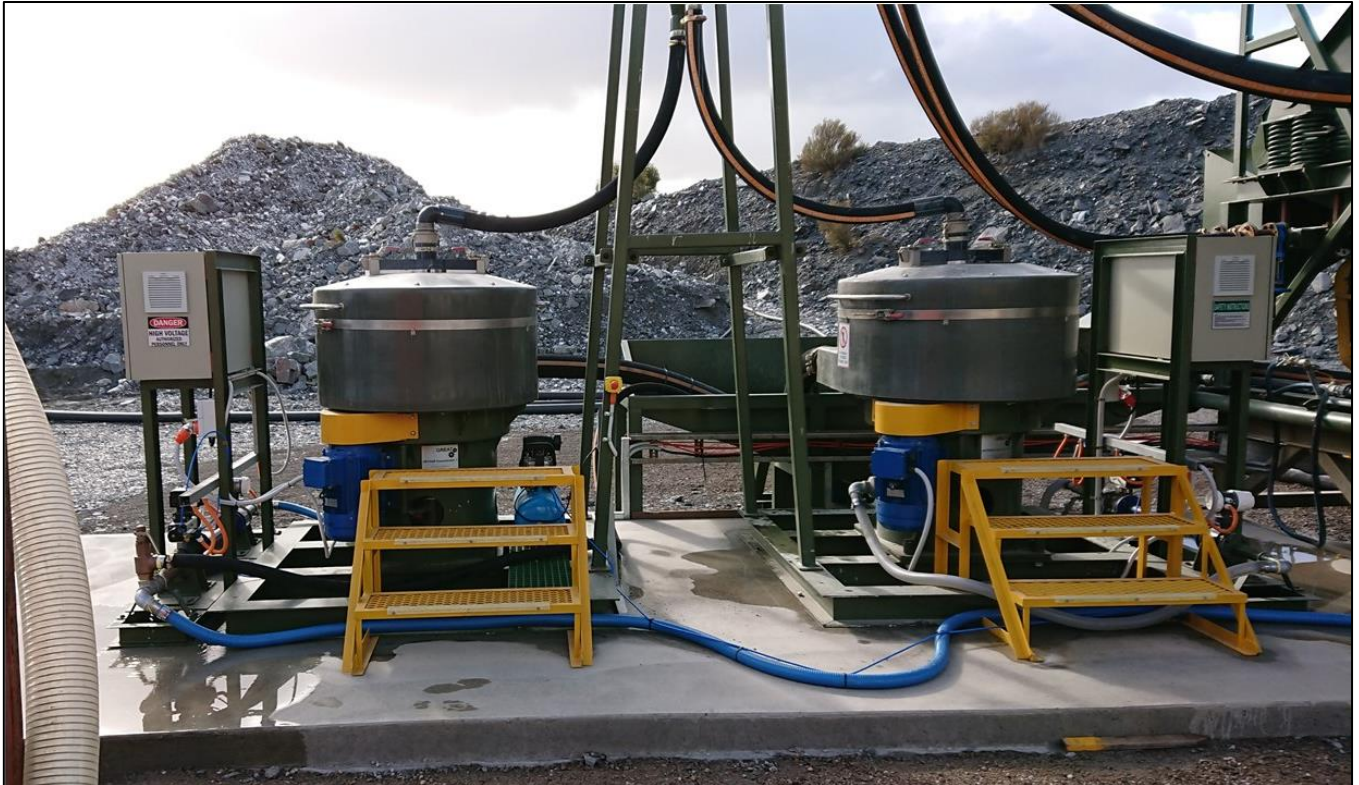
Figure 5: Great Engineering Concentrators