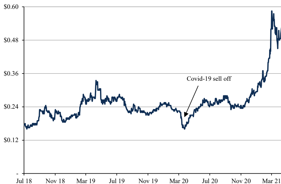
Grange – share price history (1) 1 July 2018 to 12 April 2021

73 The following chart illustrates the movement in the share price of Grange from 1 July 2018 to 12 April 2021: