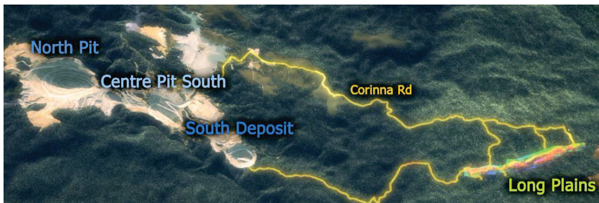
Grange – map of Savage River operations