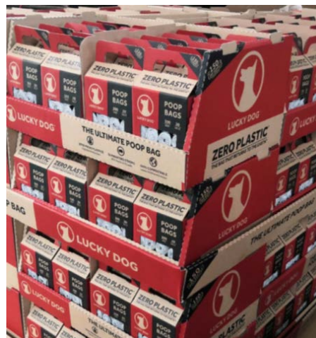
A picture of Lucky Dog™ pallet ready for dispatch in USA.

As announced on 10 August 2020, SECOS secured a significant supply contract with leading United States pet supply company JC USA Inc a wholly owned subsidiary of Jewett-Cameron Trading Company Limited (NASDAQ Code: JCTCF “Jewett-Cameron”). Initial finished products commenced shipment at the end of August. Concurrently, SECOS is expanding film and bag capacity to supply anticipated future increases in order volumes. Initial feedback from the customers was with enthusiasm and higher than anticipated demand.