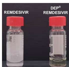
DEP® remdesivir has >100-fold higher solubility than remdesivir

In contrast, Starpharma's DEP® remdesivir is a highly water-soluble nanoparticle formulation of remdesivir with controlled release properties, which would potentially allow for less frequent dosing and use in a non-hospital setting, such as aged-care. The solubility of DEP® remdesivir is 100-fold higher than standard remdesivir. The benefit of DEP® remdesivir's enhanced aqueous solubility is that it would enable subcutaneous injection rather than intravenous infusion, allowing for outpatient treatment and reducing the burden on hospitals.