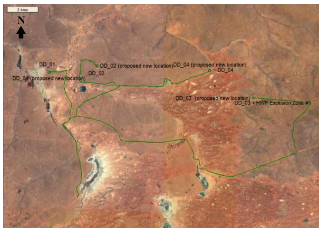
Figure 1: Overview of Horse Well area showing location of drill sites.

Field personnel have been deployed to site to ensure access tracks and drill pad preparation have been completed in accordance with the approval conditions (Figure 1).