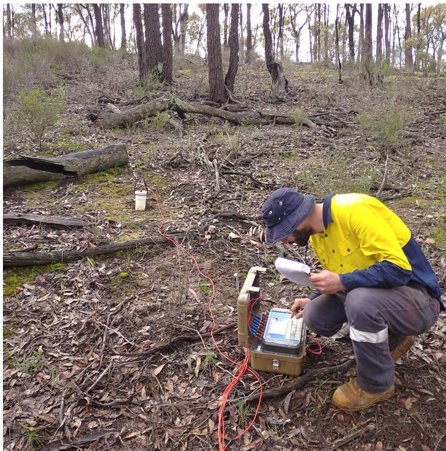
Figure 2: Geophysics survey underway at the Jubilee Gold Project.