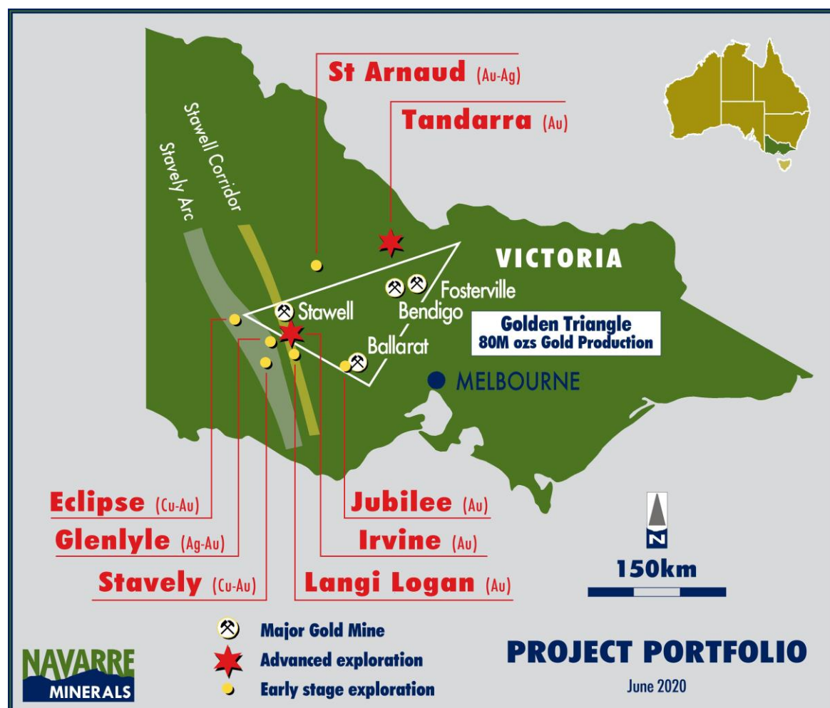
Figure 1: Location of Navarre's premier mineral projects in Victoria.