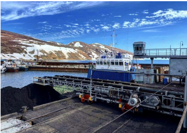
Belt conveyor loading of TIG's 500t barge

During June, TIG loaded 159kt with an average daily loading rate of 8.3kt per workable weather day and maximum achieved loading rate of 9kt per day. TIG shipped three cargos of thermal coal during June and one cargo with thermal coal in July. On 21 of July TIG completed loading the fifth cargo with semi-soft coking coal. Transshipment is performed with TIG's four 500-tonne barges.