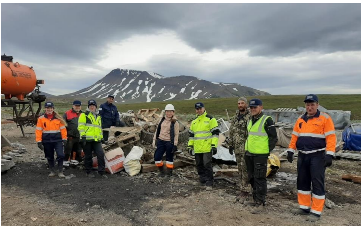
Trash and industrial garbage collection in camp

Managing the environmental impact of TIG's activities is a key priority for the Company. On World Environment Day (June 7 th ) for the third year in a row TIG staff organized trash and industrial garbage collection in the township to improve the safety and overall quality of the local environment. TIG has created a hotline for enquiries regarding mining and ecology in Beringovsky.