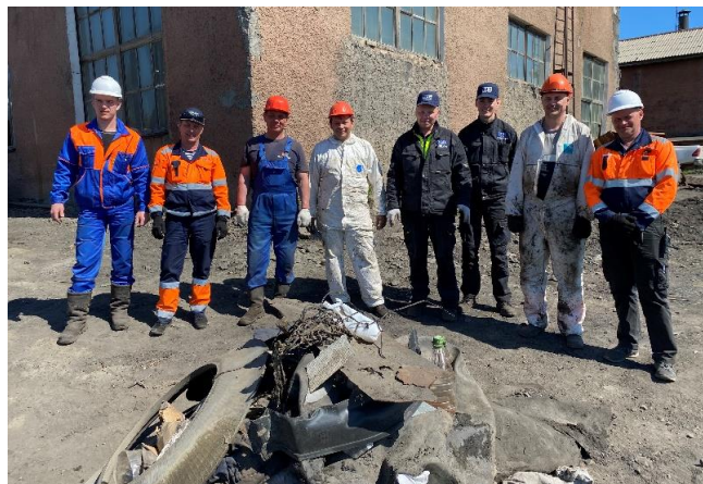
Garbage collection in port

TIG has continued interactions with the Association of Indigenous People of Chukotka: three indigenous community projects were selected for funding support by TIG in cooperation with the Association. In early June representatives of the Association visited the port to evaluate the impact of our operations on the local environment. TIG demonstrated the operation of the recently repaired coal conveyor and our fleet of 500kt barges. Visitors have expressed their appreciation of TIG's efforts to improve environmental standards and to assist with the general clean-up of the town.