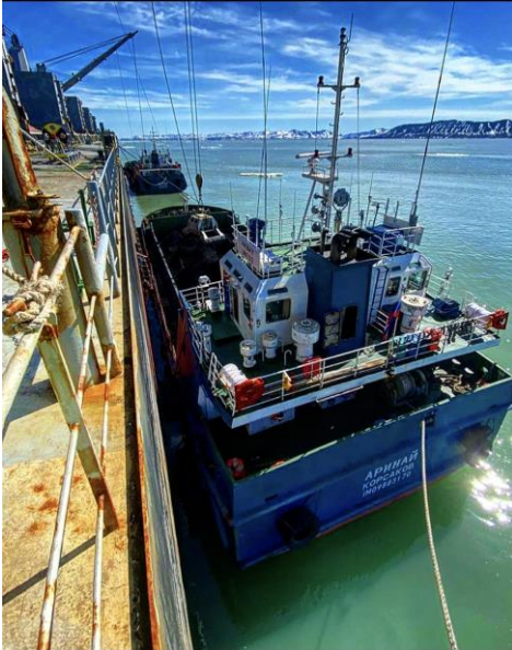
TIG 500t barge unloading

TIG has successfully started the 2020 shipping season – the first season in which TIG fully manages all port activities. Preparations for the season included extensive dredging works, bringing and training over 70 port personnel to Beringovsky, repair works on apartments and other housing and lodging arrangements, maintenance of the coal loading system, repair works on our fleet and obtaining all necessary licenses and approvals.