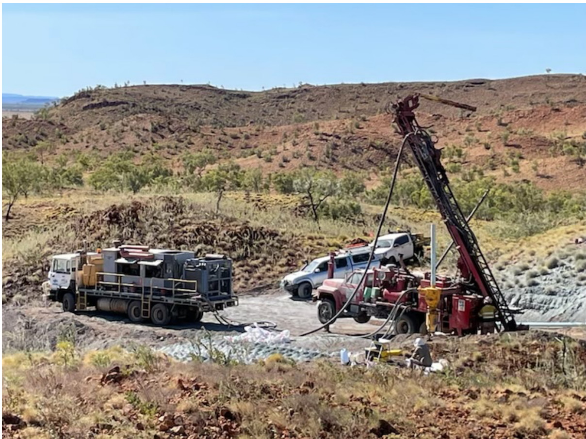
Figure 1 2022 RC Drilling at the Eastman Intrusion

Peako Limited (ASX: PKO, Peako) is pleased to advise that a 4500m reverse circulation (RC) drill program has commenced at its Eastman PGE Project in the Kimberley region of Western Australia; a large underexplored layered mafic to ultramafic intrusive complex that Peako considers prospective for a major PGE resource.