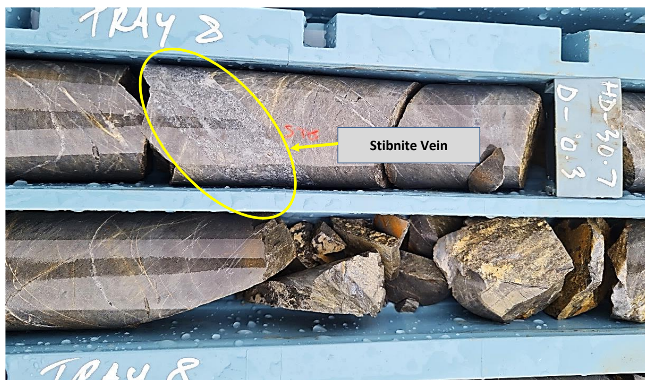
Figure 2: Stibnite Veining in ELG164

Historically, Garibaldi had a small open pit which is approximately 155m long, 40m wide and 10m deep to take advantage of the multiple gold lodes and bulk low-grade material.