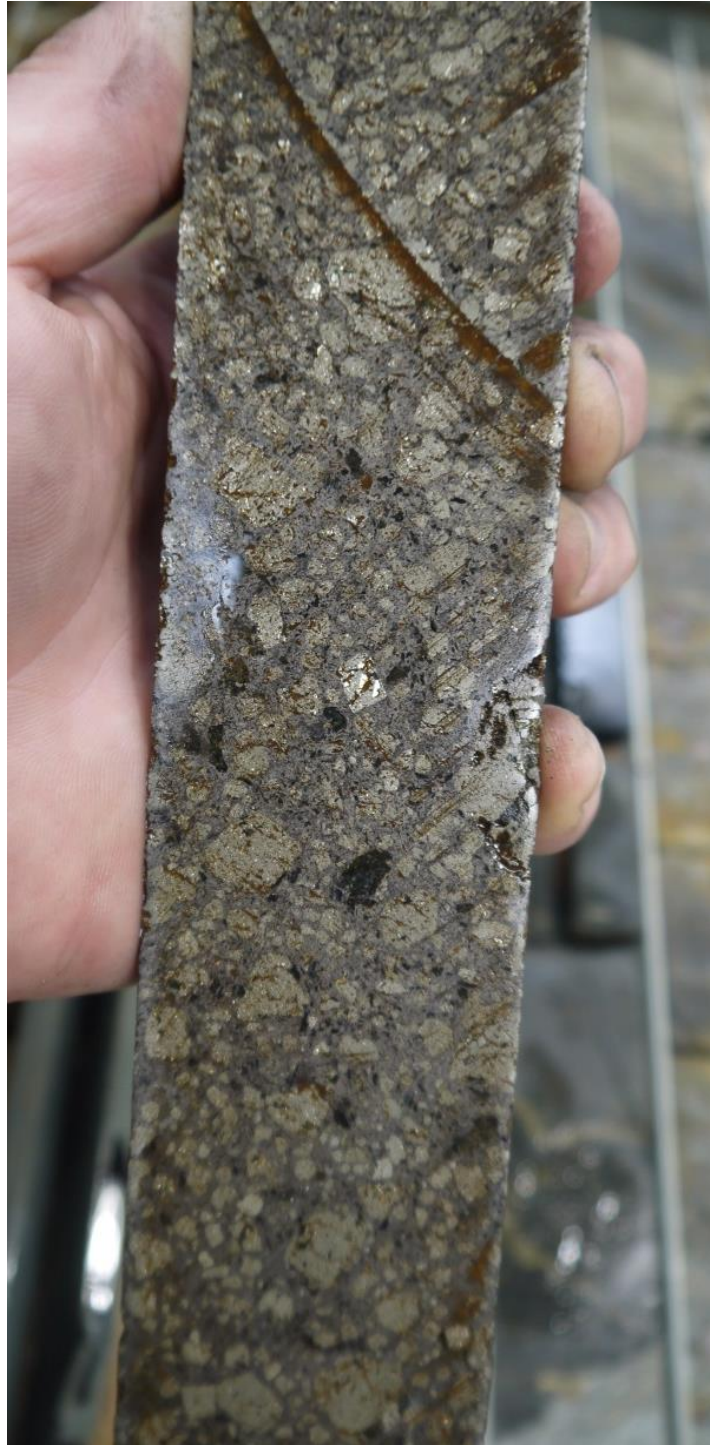
Figure One | Image of Historic Drill Core