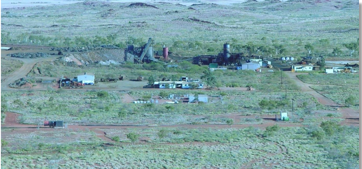
Figure 3: AGIP Radio Hill Nickel/Copper Operations (Fox 100%) – Radio Hill 425,000 tpa Treatment Plant and floatation circuits.