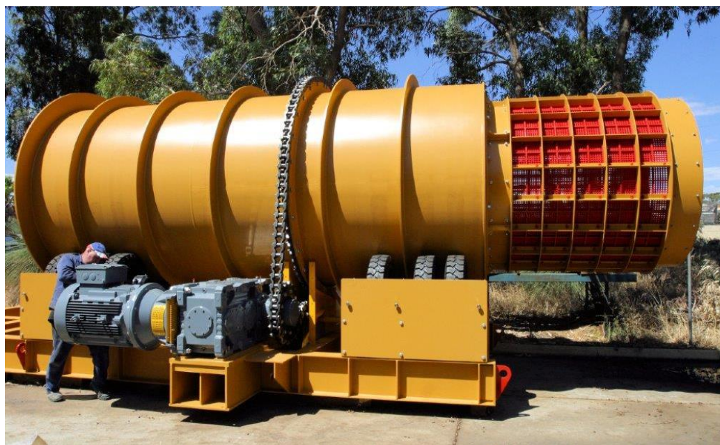
Figure 2. A scrubber of the type that would be used for the Malingunde saprolite-hosted flake graphite deposit in a production scenario.

The planned process flowsheet does not contain an upfront crushing or grinding circuit. Instead, the flowsheet incorporates a scrubber (similar to a trommel) to wash & disaggregate the graphite flakes from the host material prior to flotation. This provides significant capital & operational cost benefits over traditional hard-rock crushing & milling equipment.