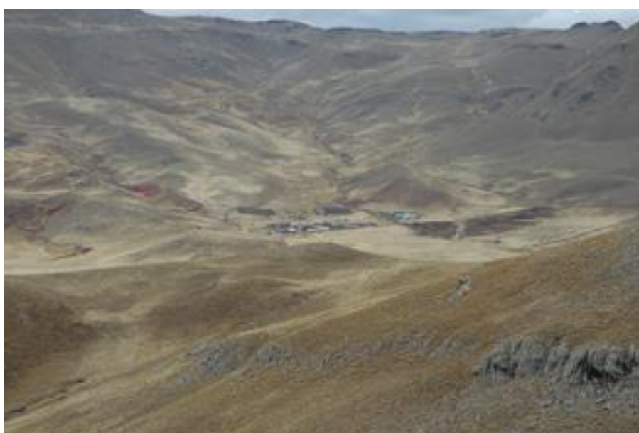
View Across Berenguela Property