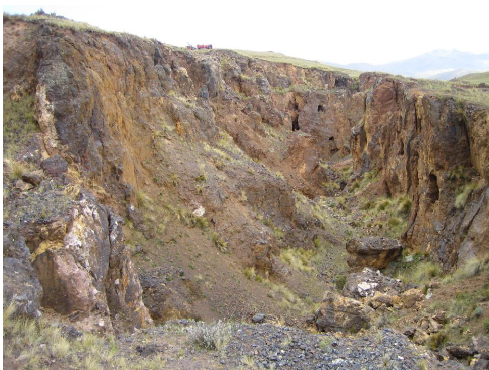
Open Pit Location of Historical Mining

The Berenguela Project has been extensively explored and exploited starting in 1906 as property of the Lampa Mining Company – Peru. It is estimated that the Lampa Mining Company extracted approximately 500,000 tonnes of ore, producing an estimated 15 million ounces of silver between 1906 and 1965. Ore was extracted from small open-pits and underground workings.