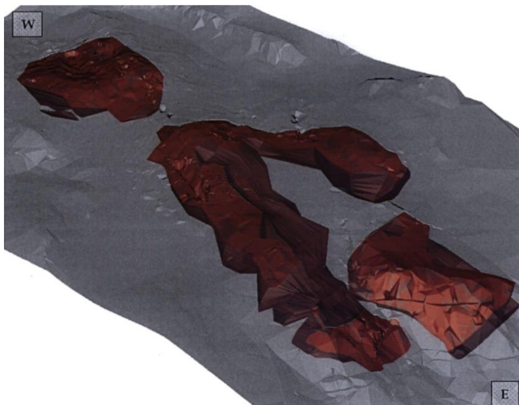
Berenguela Deposit Model

Silver Standard delineated a deposit which extends approximately 1,400 meters in length, between 200 and 350 meters in width and a thickness between 30 and 100 meters.