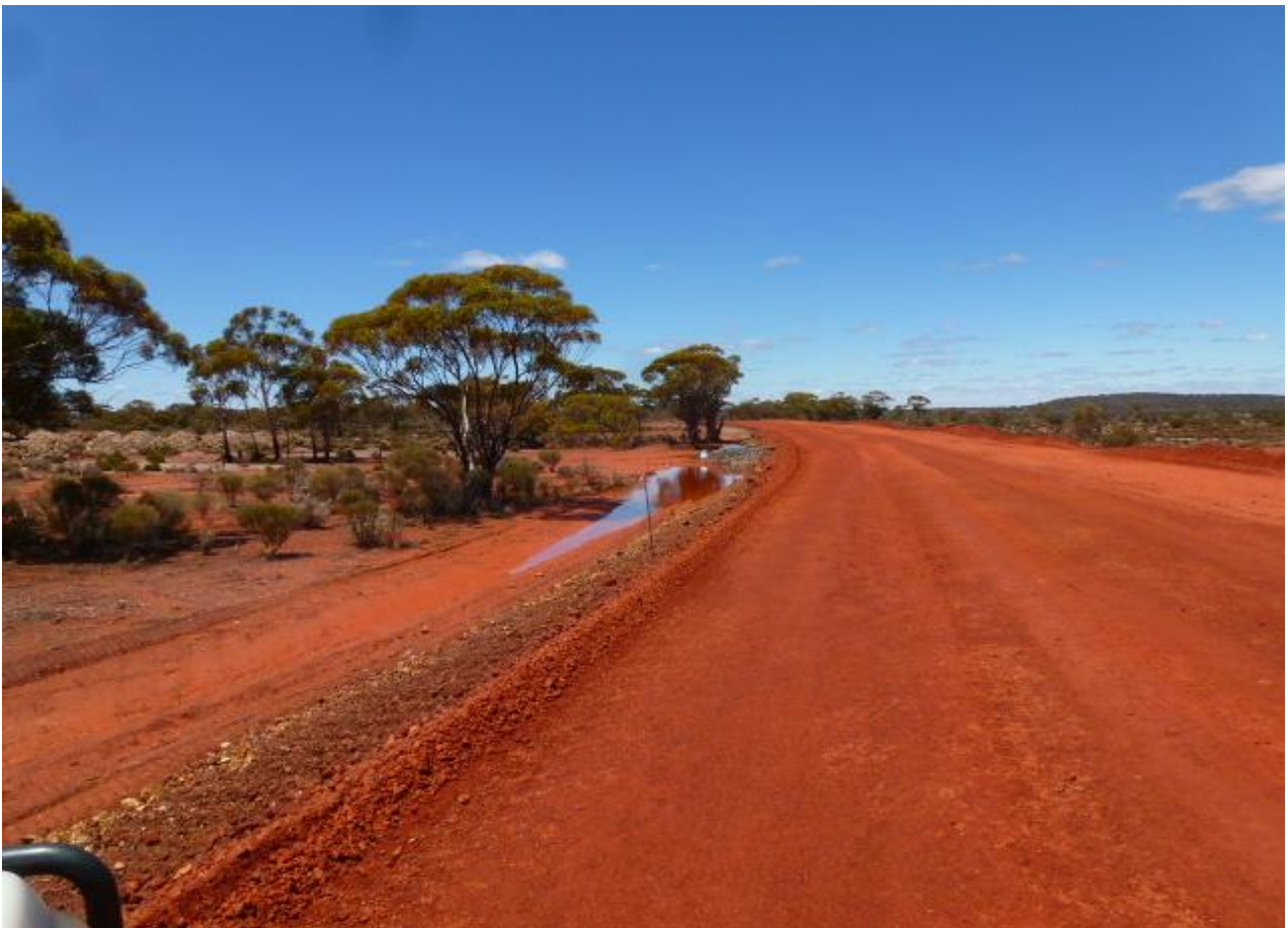
Figure 5 : Road diversion at Mine Entrance after recent flooding