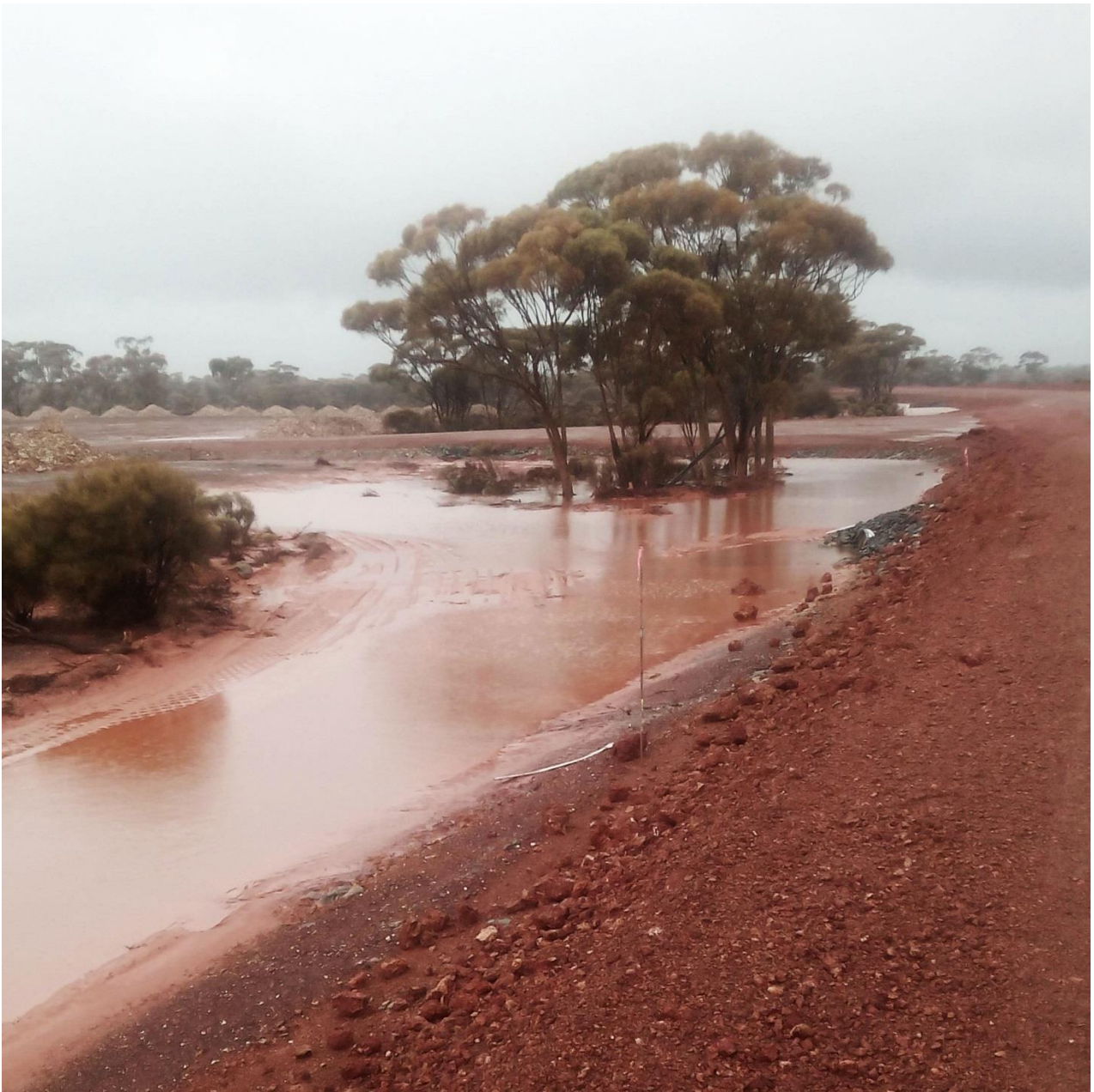
Figure 4 : Road diversion at Mine Entrance during rain (ROM pad far left)