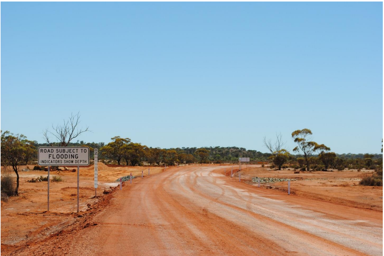
Figure 3 : Completed road diversion