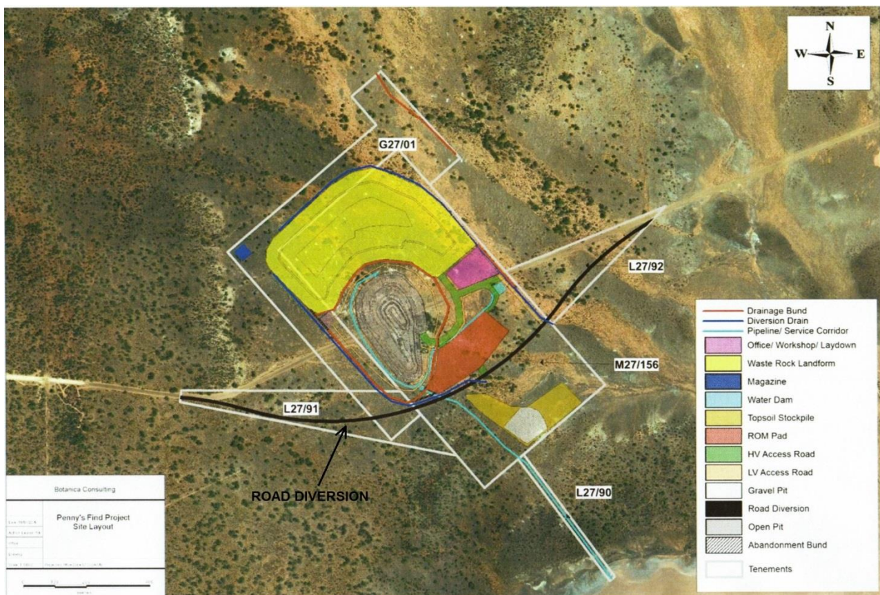
Figure 6 : Mine Plan on Google Earth