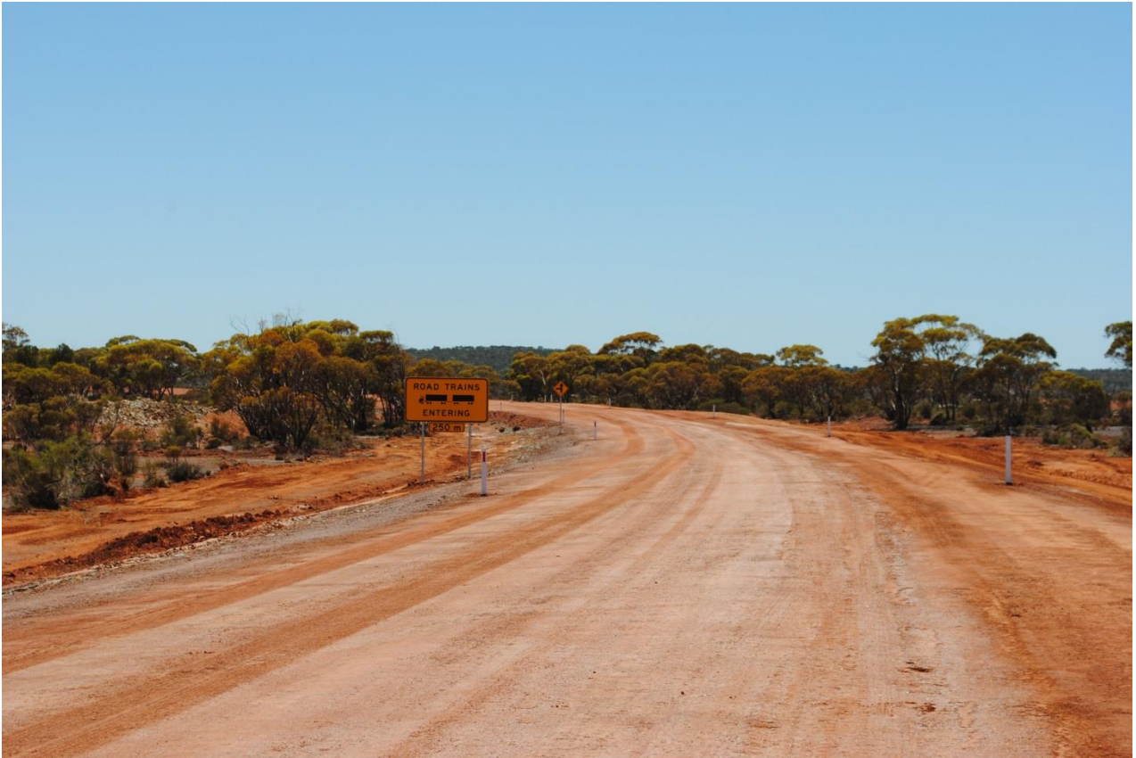
Figure 2 : Completed road diversion near the mine entrance