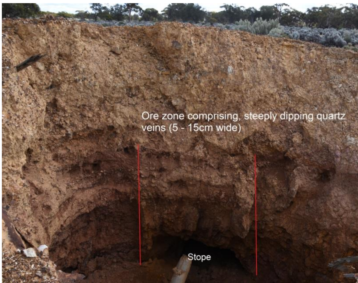
Figure 4: Priority target, looking west at an old shaft near Seven Seas

In addition, 1,000m of drilling will be completed to test four IP targets after the Company was awarded $60,000 in Exploration Incentive Scheme ("EIS") co-funding from the Western Australian Government.