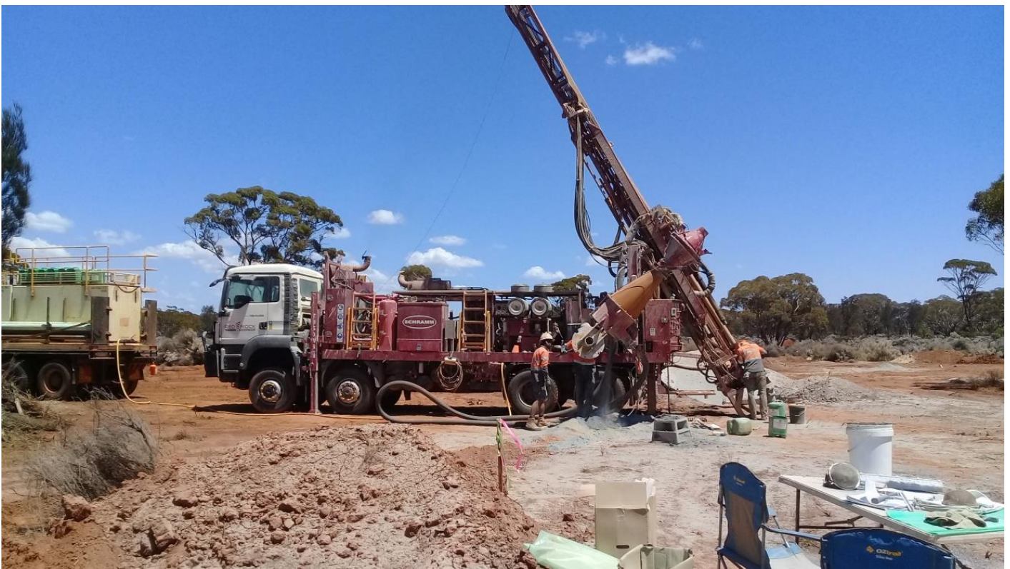
Figure 3: First drilling program at Blister Dam in over 10 years

The drilling intersected mineralisation in the majority of drill holes and confirmed the dominance of ultramafic and sedimentary rock types with quartz and pyrite regularly logged. The successful campaign identified a number of new prospects including Argo, Seven Seas, Syledis, Tasman and Atlantic.