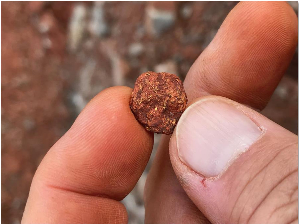
(Figure 3: Gold nugget extricated from matrix of the lower conglomerate at the Powerline showing.)