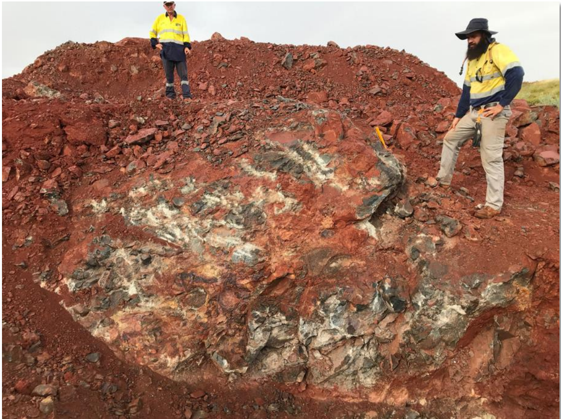
( Figure 4: Wall of the first trench at the Powerline showing. Large boulders are evident in the conglomerate. Dark orange and red staining is from weathered pyrite occurring in the matrix of the conglomerate. Otherwise, the rock is nearly fresh. Trenches are carefully being cleaned of weathered rock in preparation for bulk sampling.)