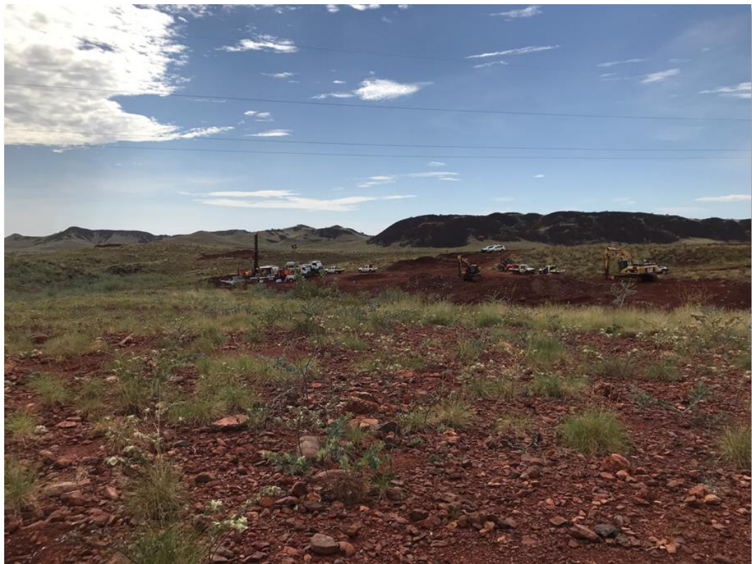
(Figure 1: Photograph of the Powerline showing looking southeast. Trenches are being opened immediately right of the location of the diamond core rig. The base of the conglomerate sequence is in the foreground and the top is approximately where the two white vehicles are parked along the ridgeline. True thickness of the conglomerate section is approximately 30 meters and is dipping away from the camera at about 3-4 degrees.)

Dr. Quinton Hennigh, the Company's, President and Chairman and a Qualified Person as defined by National Instrument 43-101, has approved the technical contents of this news release.