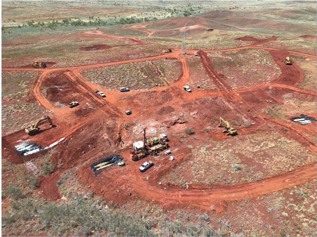
(Figure 2: Aerial photograph of the Powerline showing looking southwest. The first trench to expose bedrock is immediately behind the mast of the diamond core drill. Numerous detector strikes were encountered in multiple layers. The footwall contact of the conglomerate sequence is not exposed in this trench. In situ gold nuggets as see in Figure 3 have been extricated from rock matrix material.)