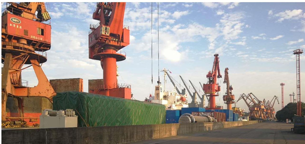
Components arriving at port