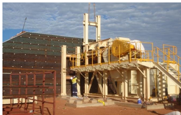
Various processing plant components under construction

WA-based Primero Group Limited, appointed for the concrete works and installation component of the project, were largely complete with the concrete works and continued the assembly program of equipment and modules during the quarter. The scope of work for Primero includes the concrete works, installation, testing and commissioning of the Browns Range Pilot Plant Project. Two shipments of equipment and modular components of the processing plant arrived on site during the quarter, with the third major shipment completed in January.