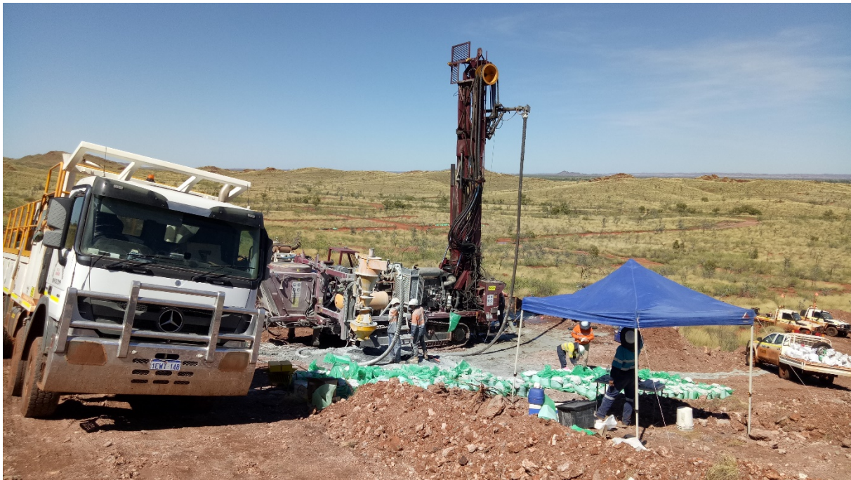
Drilling on the western side of the Southern Ridge