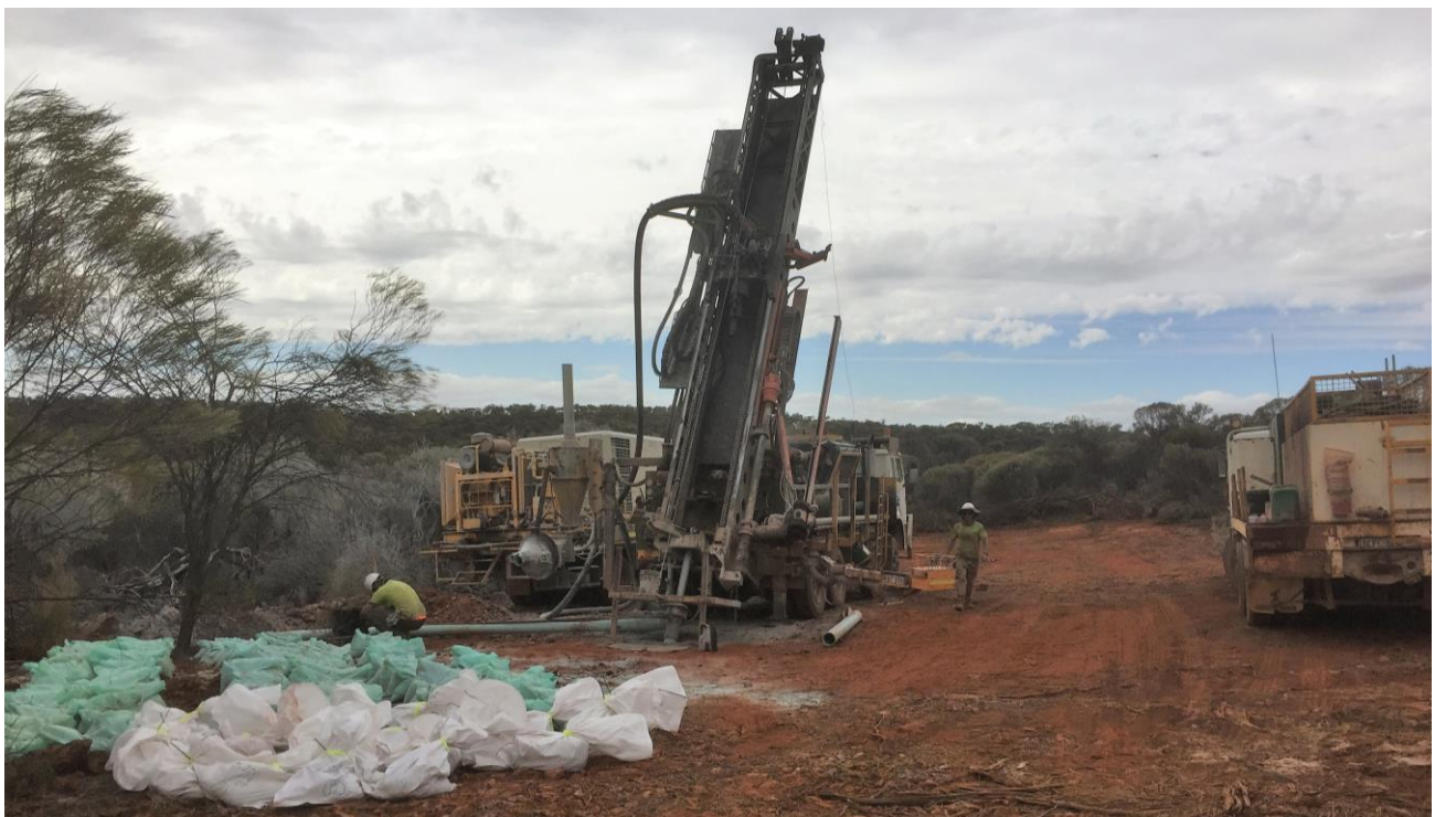
FIGURE 3 – RC DRILLING AT ROTHSAY ON WOODLEY'S NORTHERN EXTENTION