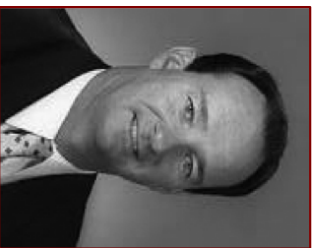
Mark Vaile AO Non-Executive Chairman. NED Virgin Air, Whitehaven & Servcorp Ex Deputy Prime Minister