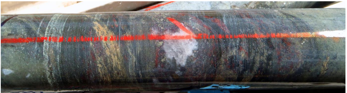
Figure 1. Veins of visible silver minerals (red-purple colour) from Hole CMIPT077 from 174.4 m which assayed 1.8 g/t gold and 4,200 g/t silver over 0.3 metres.