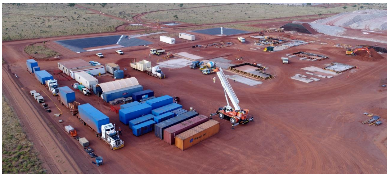
Aerial View of the Pilot Plant – Browns Range

THIS PHOTO IS TAKEN 7 MONTHS AFTER THE BOARD APPROVED THE PROJECT