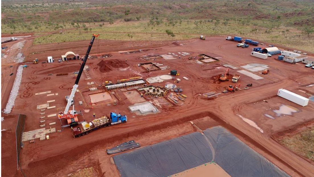
Concrete works advancing in Beneficiation and Hydromet areas

The majority of the first shipment of equipment and modular components from Sinosteel MECC was delivered to Browns Range over the last two weeks. This shipment is the first of three main shipments of process pilot plant modules and equipment, with the second shipment having departed Shanghai and due in Darwin in the coming weeks.