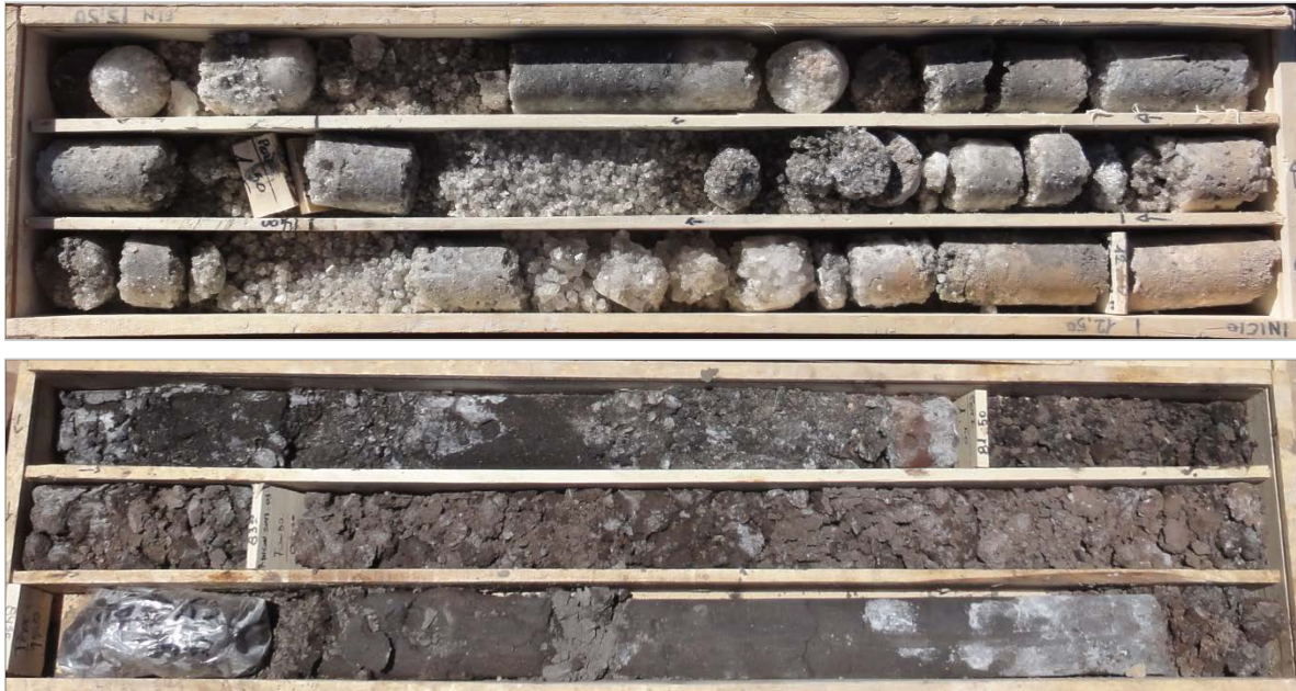
Photos 1 & 2. Rincon Lithium Project – Porous crystalline halite (top) and black sand unit (bottom)

Argosy Managing Director, Jerko Zuvela commented “ The exploration diamond drilling program is exceeding our expectations with deeper drilling confirming greater brine bearing thickness than previously assumed. Initial analytical results to date confirm lithium brine grade varies in the general range of 400mg/l to near 500mg/l, with an Mg/Li ratio lower than historical reference data. Confirmation of a thick sequence of black sand in the Project area is also very good news for future brine extraction.