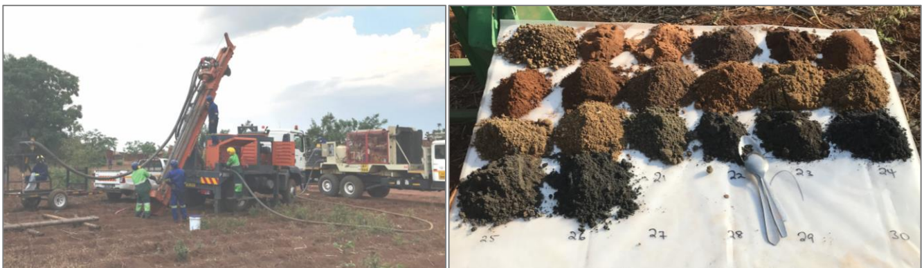
Figure 1a (LHS) – 2017 infill aircore drill rig in operation at Malingunde.