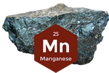
LARGE MANGANESE RESOURCE