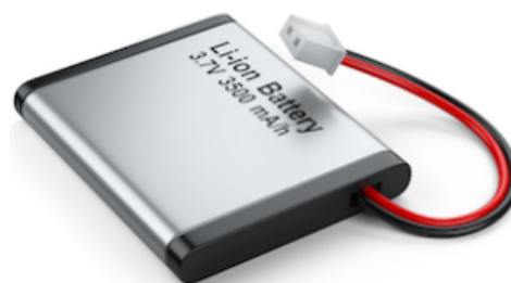
HIGH PURITY MANGANESE PRODUCTS