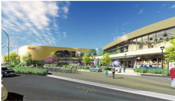
An artist's impression of the upgrade to Carousel shopping centre, Perth.

Westfield Carousel received approval last year for a $235 million expansion that will see the Cannington centre grow to 130,300 square metres.