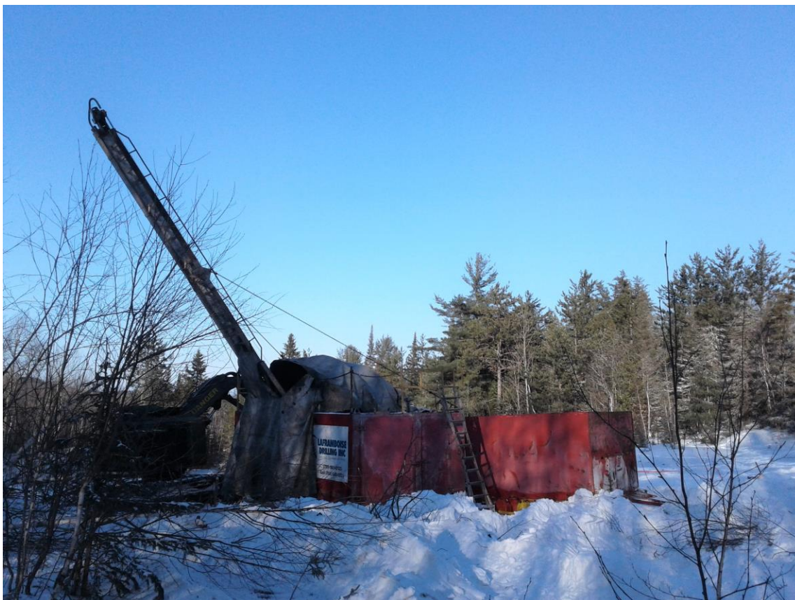
Image 1. Laframboise Drilling at the Bellellen mine.

Following the drilling at Bellellen, an additional 1,000 metres are planned at Keeley-Frontier to test strike extensions of newly identified cobalt-nickel-silver mineralization at the Woods Extension area north of the Frontier mine and at the KeeleyCo area southwest of the Keeley mine. The next 3,000 metres of drilling will focus on the Drummond and Kerr mines in Cobalt North to test targets generated from 3D structural interpretations of historic mine data compilations currently underway. The winter program will be conducted by Laframboise Drilling from Earlton, Ontario.