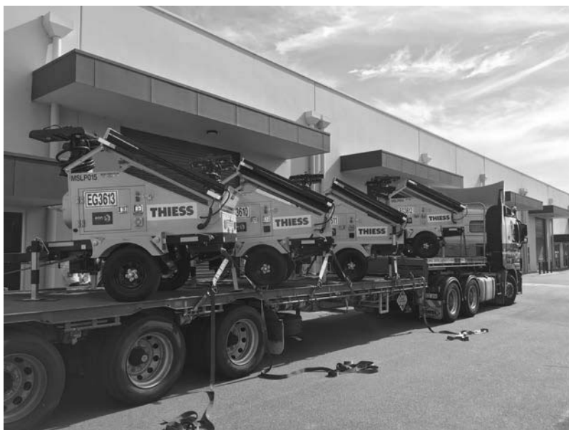
Figure 4 - EcoQuip MSPT LED Lighting Tower (Gen3)

The EcoQuip business strategy primarily comprises: