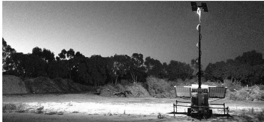
Figure 3 - EcoQuip MSPT LED Lighting Tower (Gen3)

EcoQuip is a privately owned Australian business established in 2010. EcoQuip's primary activity comprises the design, manufacture, supply and service of a mobile solar powerbox trailer incorporating a robust military specification retractable tower for LED lighting, Wi-Fi repeater and CCTV retro-fit (MSPT).