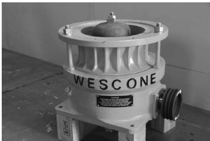
Figure 2 - W300/3 Sample Crusher

The W300 sample crusher is the only high-speed sample cone crusher of its size and capability available globally and, to date, approximately 300 W300 crushers have been supplied in the resources industry based on an equipment sale and service business model. Approximately 200 W300 Wescone sample crushers are in operation in Australia and overseas.