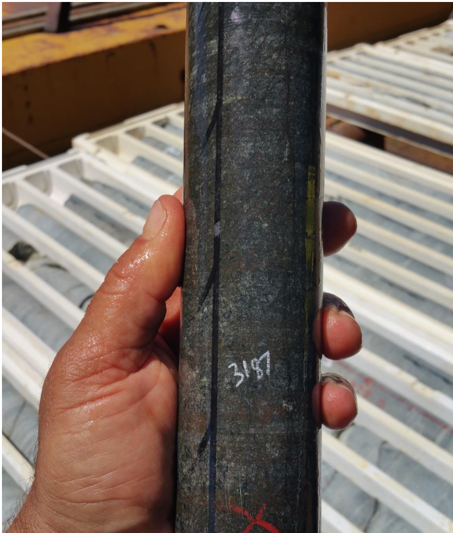
Figure 1. Photograph of a sample of poikilitic olivine rich ultramafic rock with fine grained cloud nickel sulphide associated with silver and red brown iron oxide aggregates from approximately 547m downhole in NCB0003.