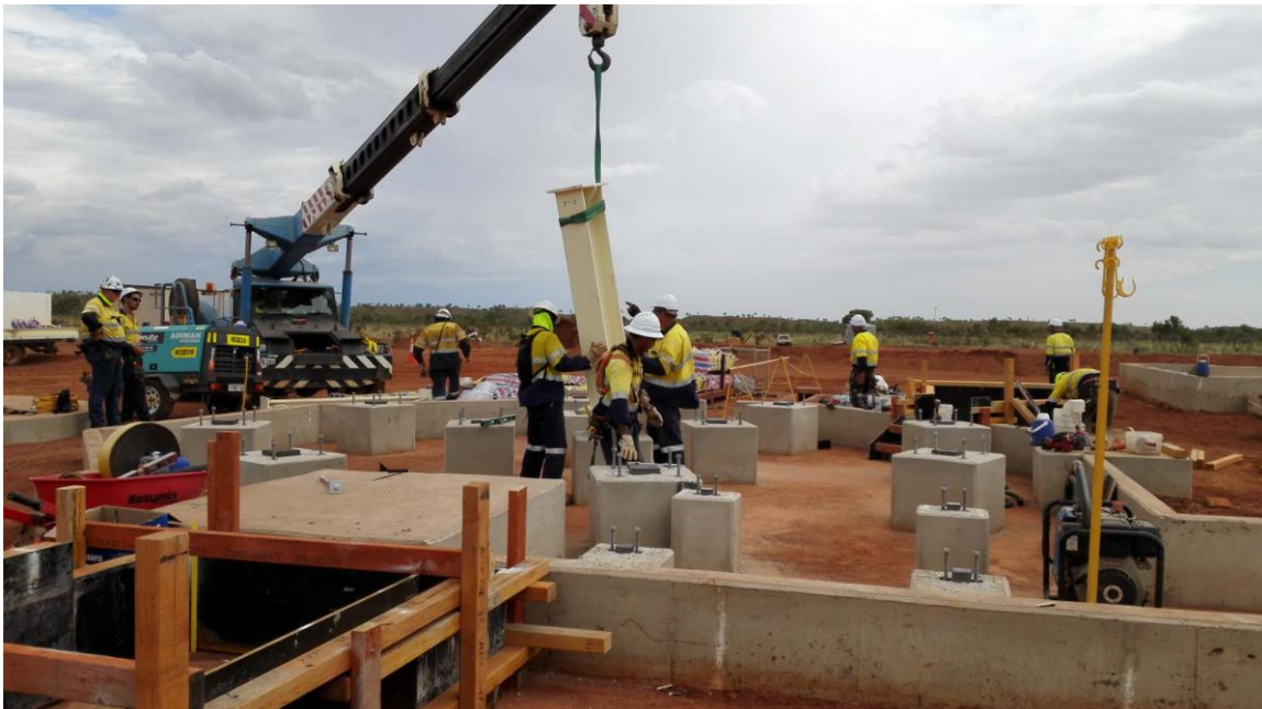
First steel going up at the tailings thickener