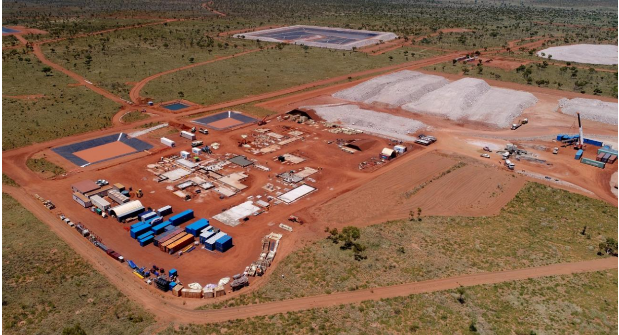
Aerial View of the Pilot Plant, ROM pad and ore stockpiles

Primero Group is nearing completion of the concrete works in the beneficiation plant area and are making good progress with concrete works in the hydrometallurgical plant area, with the milestone of 1,000m 3 poured on site. This represents over 67% concrete works complete.