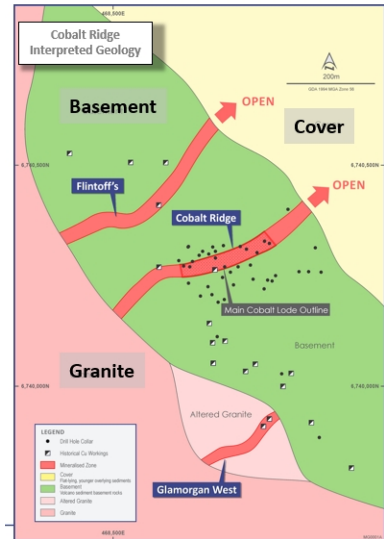
Figure 2 – Cobalt Ridge Interpreted Geology Plan

The mineralisation at Cobalt Ridge is located within a small window of basement rocks, sandwiched between unmineralised granite to the west and thin, younger sediment cover to the east (Figure 2). This basement outcrop is geochemically anomalous in cobalt, copper and gold. Several sulphide lodes were mined in the late 1800's – early 1900's, on a small-scale basis. To a large degree, this historical work has provided a focus for modern exploration. However, surface geochemistry and mapping suggest the cobalt-copper-gold mineralisation is much more extensive than that defined by previous exploration and mining, which was focused solely on the copper mineralisation.