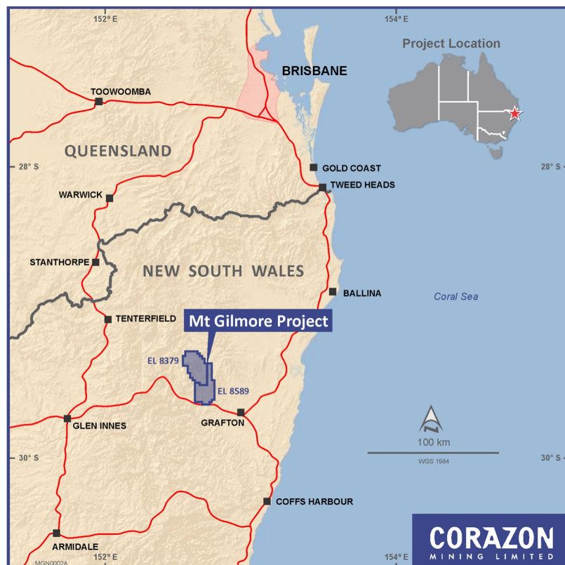
Figure 3 – Project Location

The Mt Gilmore Project is located 35 kilometres from the major centre of Grafton in north-eastern New South Wales. Corazon owns a 51% interest in Mt Gilmore and has an exclusive right to earn up to an 80% interest in the Project.