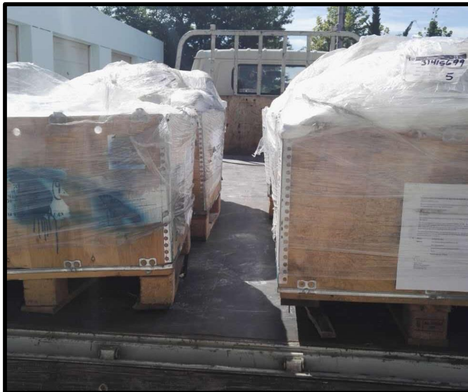
Figure 3. Image of the Seymour Lake spodumene bulk sample being delivered to Yantai, China.

Ardiden is pleased to confirm that the preparation of the bulk sample and initial metallurgical testwork program has now commenced at Yantai's premises in China. The bulk sample is required to go through several crushing and screening stages to ensure it meets the correct fraction sizes required.