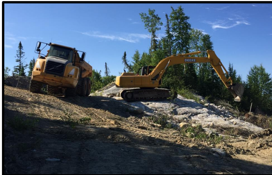
Figure 1. Excavator and truck collecting the bulk sample from North Aubry prospect.

Diversified minerals explorer and developer Ardiden Limited (ASX: ADV) is pleased to confirm that the Seymour Lake bulk sample obtained from the North Aubry prospect at its 100%-owned Seymour Lake Lithium Project in Ontario, Canada, was received in late September by the Company's strategic partner, Yantai Jinyuan Mining Machinery Co., Ltd ("Yantai").