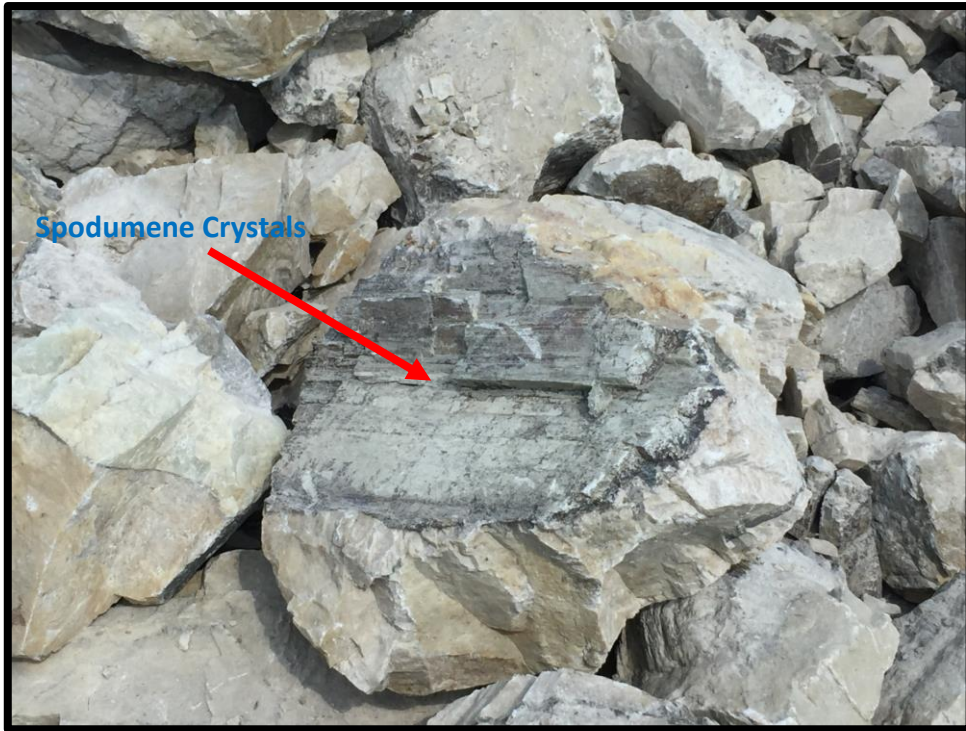
Figure 2. Bulk sample of Spodumene bearing pegmatite obtained from the North Aubry prospect. Highlighted in the image are the large high quality Spodumene crystals

Ardiden is pleased to confirm that the preparation of the bulk sample and initial metallurgical testwork program has now commenced at Yantai's premises in China. The bulk sample is required to go through several crushing and screening stages to ensure it meets the correct fraction sizes required.