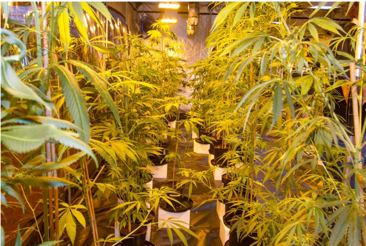
MCL Live indoors under lights hemp display at HHI Expo

Please find below a few photos taken from MCL exhibition and presentation at the Hemp, Health & Innovation Expo.