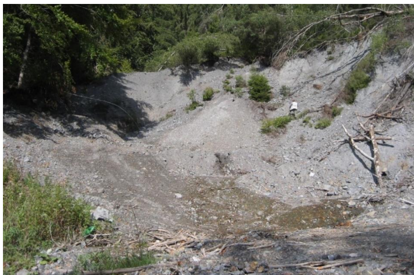
Figure 1: Middle Terezia Waste Dump